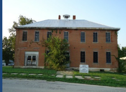
The 1910 Gerald School Building