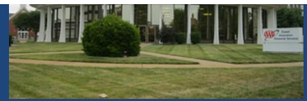
SAVED: THE AAA BUILDING FROM MISSOURI'S 2012 MOST ENDANGERED HISTORIC PLACES

If you have questions about applying for these grants, contact the National Trust at grants@savingplaces.org or call 202.588.6277.