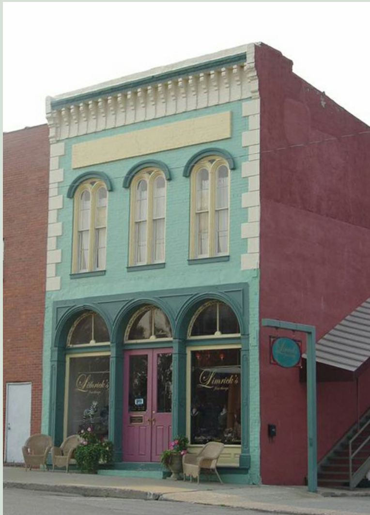
Limerick Building in Lexington - Renovated using Historic tax credits

THE ALLIANCE FOR INVESTMENT, JOBS & PRESERVATION IN MISSOURI