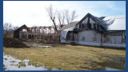
Simmons Stable undergoing renovation in 2009

The Missouri Barn Alliance and Rural Network (Mo BARN) will hold its spring meeting at the Simmons Stables in Mexico on Saturday, March 16 at 10:00 am, followed by a history and tour of the Stables, then lunchtime together. More information at: