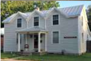
(Before & After)