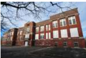
Preserve Missouri Award winners - Bancroft School Apartments (before & after)