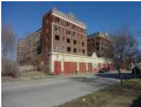
Freedom Pace (before)

The historic 1928 apartment building had been vacant for six years before the Vecino Group embarked on a multi-million dollar rehabilitation project that created 68 affordable housing units for formerly homeless veterans. Storefronts on the first floor, once boarded over, now house offices and service areas for residents. An integral historic parking garage continues to serve its original use. Bright comfortable apartments fill the upper floors. Historically accurate replacement windows fill the gaping window openings that had left the building open to the elements while it was vacant. Beyond the direct benefits to the building's residents, the project has helped to stabilize surrounding property values. The empty shell is once again full of life and most importantly is an asset to the community.