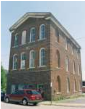
Preserve Missouri Award winner - Ironton Lodge Hall (before)

In the late 19 th century, every small town had at least one lodge hall, typically housed on the upper floors of a Main Street building. The fraternal meeting halls are distinctive spaces that can be difficult to adapt without losing the historic feeling of the large open room. Yet, Brian and Emily Parker were able to meet this challenge when they repurposed the 1873 IOOF lodge hall in Ironton. They designated the first two floors for piano instruction and performance, which preserved the volume and key architectural features of the 2 nd floor lodge hall. The 3 rd floor became a loft apartment for the Parker family. The rehabilitation included repairing the wood windows, repointing masonry, rebuilding the wood cornice and structurally reinforcing the neglected roof and historic staircase. In this small town, their project has brought life back to a key building that had been endangered by neglect.