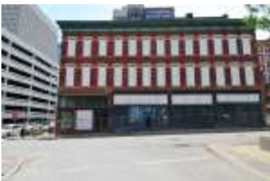
Cosby Hotel (before)

The 1881 Cosby Hotel is one of the few 19 th century commercial buildings left in downtown Kansas City. It was days away from demolition when developers Jason Swords and Lon Booher stepped up with a plan to rehabilitate the building. The first floor commercial space had been unoccupied for several years; the upper floor hotel for almost a half-century. Their first step was to stabilize the structure. This included replacing the roof, repointing masonry, installing windows, and jacking the sagging 2 nd and 3 rd floors. Incredible historic fabric found during the rehabilitation was restored to give the first floor businesses – a deli and a bakery - not only unique, but dazzling spaces. The upper two floors were transformed into small office suites with shared amenities. The project was challenging in every way imaginable and would not have been possible without incredible support from city and civic leaders. The Cosby Hotel is an incredible gem in the restored fabric of downtown Kansas City.