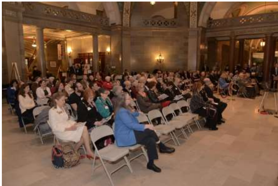
2015 Honor Awards Ceremony crowd

This year's Preservation Honor Awards ceremony took place at 11:00 a.m. Wednesday, March 4, 2015 in the Capitol Rotunda in Jefferson City. Despite the snowy March weather, we had a great ceremony. Thirteen recipients were recognized for their achievements in historic preservation in Missouri. This year's honorees were: