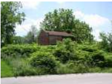
Preserve Missouri Award winner - Jacob Price House (1413 Lafayette) (before)

The restoration of 1413 Lafayette Street was a labor of love for owner Jeff Simpson. Built in 1852 and last occupied in the 1960s, the modest house was in extreme disrepair when Jeff acquired it in 2010. At a Missouri Preservation workshop Jeff received guidance and encouragement to apply for historic tax credits and to complete the rehabilitation in a preservation-minded way. While decades of roof leaks and broken windows had left the plaster and other interior features crumbling, the house had good bones. Jeff restored as much of the original fabric as possible, including original windows, and replicated missing elements, such as the rear porch. Jeff also incorporated features to make the house sustainable for the 21 st century. Insulation was added to the attic, and a solar array on the back roof supplies half of the home's electricity. Sensitive restoration work combined with modern updates preserved the house at 1413 Lafayette Street while preparing it for its next century and a half.